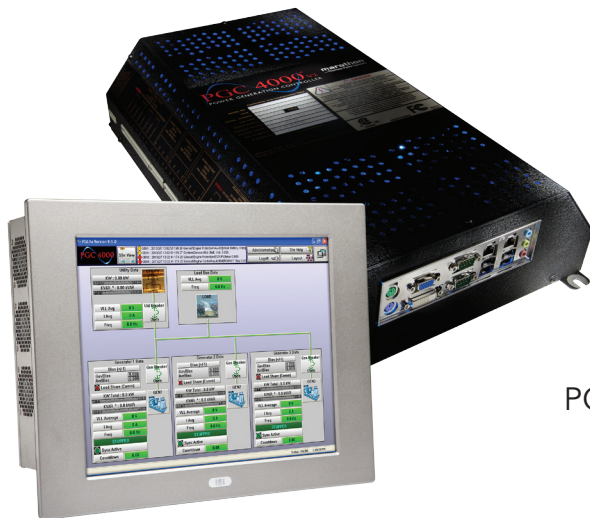
PGC 4000v2 CONTROLLER

One PGC 4000v2 controller is required for each generator set.