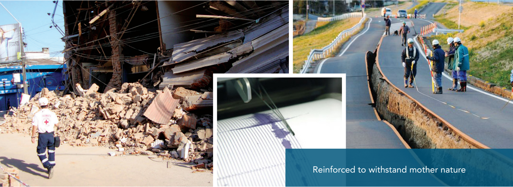
Reinforced to withstand mother nature

Thomson Power Systems Switchgear and automatic transfer switches have been tested to withstand seismic events as defined by the International Code Council Evaluation Service (i.e. ICC-ES) AC156 Standard. This test standard was developed specifically for non-structural components such as electrical equipment that must withstand specific forces of a seismic event when simulated in a shaker table test environment. The AC156 Seismic test standard has been developed in accordance with the International building Code (i.e IBC) section 104-11.