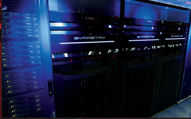
SuperNAP houses the world's most advanced Colocation center and most sophisticated technology ecosystem