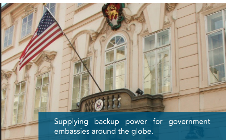
Supplying backup power for government embassies around the globe.